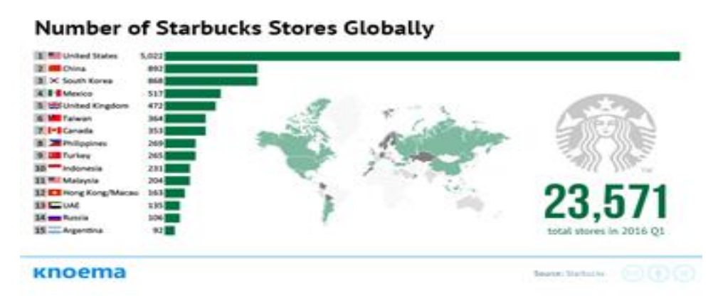
Figure 2. Number of Starbucks Stores Worldwide 2016

This case discusses the human resource management policies and work culture at Starbucks. Also, to understand the importance of human resource management policies, work culture and employee motivation to achieve organizational success.