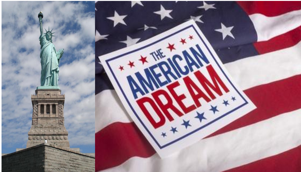
Figure 2. American Dreams is a spirit of heterogeneity that binds the common ideals of American citizens in building the glory, majesty, and greatness of the United States of America

America's progress and hegemony since the beginning of the 20th century after World War I until today was an accumulation of superior human and natural resources built from the spirit of the American Dreams. This spirit binds common ideals to unite the heterogeneity of the American people into a superior nation in various aspects such as economic, monetary, military, political, technological, and so on. Steel Henry (1992) mentions ten main elements of American cultural values that form the spirit of the American Dreams, namely: 1) Liberty; 2) Democracy; 3) Equality; 4) Opportunity; 5) Education; 6) Progress; 7) Peace; 8) Mass well-being; 9) No right class stratification; 10) Limited government.