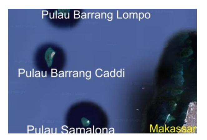
Figure 2. Cu concentration in 3 islands

Analysis of essential metal in sponge by ICP-OES Analysis results of essential metal Cu by ICP-OES can be seen from Figure 2.