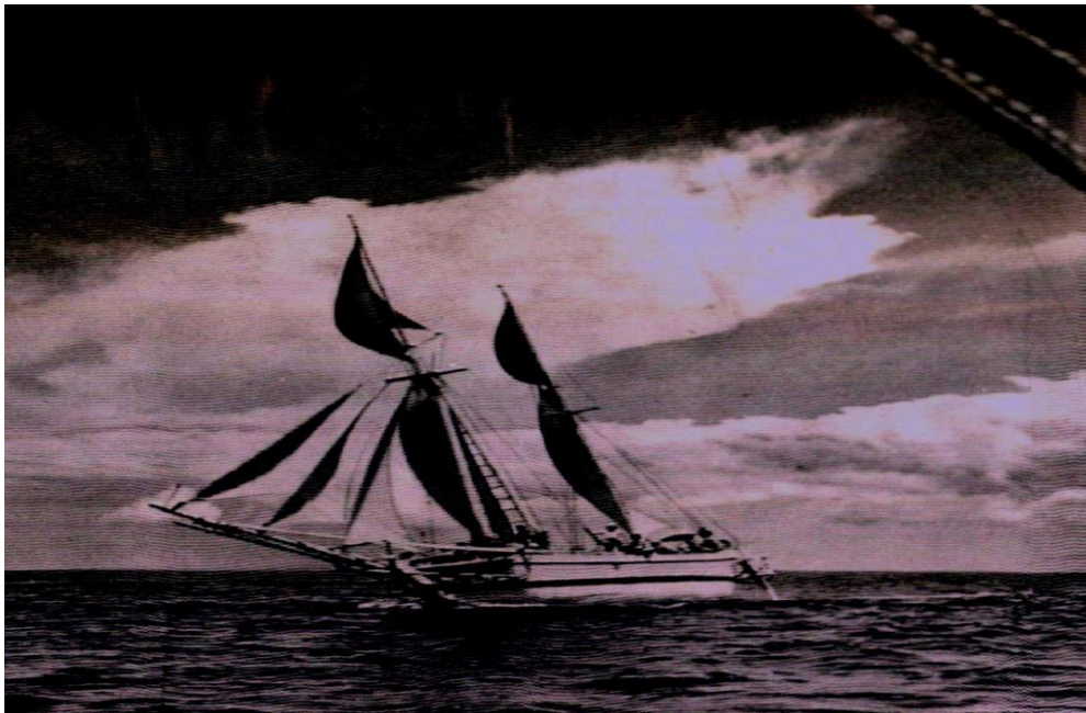
Bugis-Makassar's Pinisi boat sailing on the sea

Gale 2 ships belonged to Makassar's King, has three prows (or guling in Bugis language), which make this kind of ship more superior than one-prow ships. The three-prow ships have faster acceleration and more agile in face the sea waves. This kind of ships is usually owned by the rich and kings of Bugis and Makassar. In inter-island trading, Makassar Gale ships were considered as the most powerful ship, and therefore used by Bugis-Makassar and Malayan noblemen to transport rempah ratus from Moluccas. It should be noted that Gale ship has improves the maritime trading in Gowa, as well as other ports in South Sulawesi, since sixteenth century.