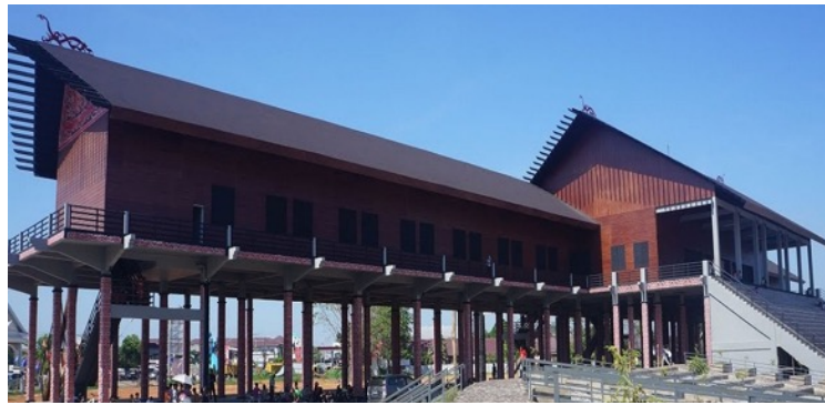
Figure 3. Huma Betang