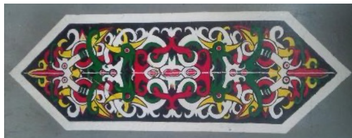
Figure 2. Talawang ornaments from Central Kalimantan