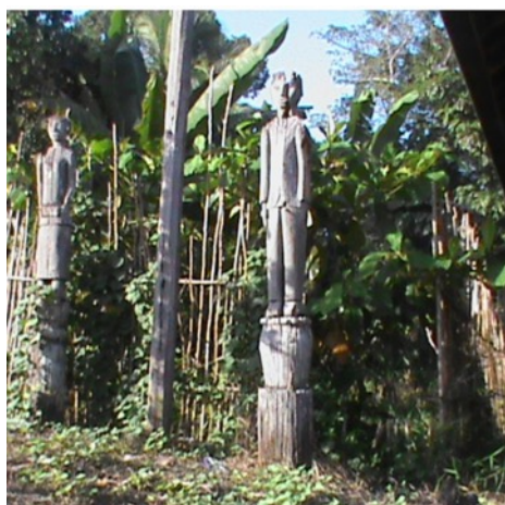
Figure 3. Sapundu in the Court of the Bulau Sahebun Traditional House ( http://cagarbudaya.kemdikbud.go.id/cagarbudaya/detail/PO2018092200010/sapundu-di-pelataran-rumah-adat-bulau-sahebun )