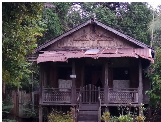
Figure 2. Huma Hai

The development of traditional Dayak buildings is influenced by ethnic types and watersheds. There are three types of traditional Dayak house patterns, namely the Betang House ( Huma Betang ), the High Pole House ( Huma Gantung ), and the Big House ( Huma Hai ). The Betang House is a center of cultural activity for the Ngaju Dayak community. The Betang House is a symbol of the Ngaju Dayak community's view of life, welfare, the macrocosm, and the microcosm (Utami & Laksmi, 2016). In addition, Huma Betang is not just a place to live but has a philosophy that contains moral elements, customary law, and symbols of harmony (Apandie & Ar, 2019; Utami & Laksmi, 2016), a symbol of family, unity, and peace (Schiller, 2007; T. B. Usop, 2016). In the past, Huma Betang was the site of the Tumbang Anoi agreement in 1984 which was an agreement between all ethnic and sub-ethnic Dayaks on the island of Kalimantan to end disputes that were previously resolved by the tradition of mengayau (beheading humans). Therefore, currently the Dayak ethnic use the Betang for deliberation (Apandie & Ar, 2019).