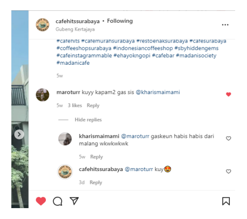
Figure 6: One form of tagging content to another account

The seven informants admitted to re-shared or forwarded information about coffee shops from @cafehitssurabaya to friends or relatives. Forwarding and sharing content @cafehitssurabaya usually through several ways: (1) via direct message personally, (2) copying the content link and sending it to WhatsApp, (3) sending screenshots of the content to the virtual group (figure 5). (4) mark mention or tagging in one of the content posts (figure 6).