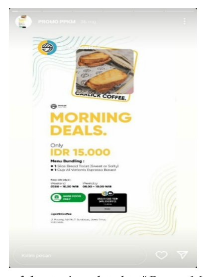
Figure 3: One of the stories related to "Promo Morning Deals"

Second, content uploading in Instagram stories section of @cafehitssurabaya contains information about a promotion or event in a certain coffee shop, congratulations cards or success flyer on the grand opening or birthday of a certain coffee shop (figure 3). In addition, through the Instagram story, @cafehitssurabaya often repost some feeds or story posts from followers who have mentioned @cafehitssurabaya.