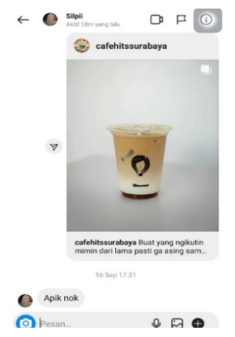
Figure 5: Content sharing activity via DM

many followers are willing to share it voluntarily to other people. It could be a co-worker, a college theme, their family, or acquaintances" (Interview @stvmrph, 26 February 2022).