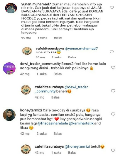
Figure 4: Display of followers' comments reviews

As an e-WoM opinion leader, @cafehitssurabaya needs to interact with followers to build information credibility. The credibility of the communicator can influence information credibility. Information credibility supports the success of social media marketing through collaboration of opinion leaders with followers to maintain good relations. Both parties (@cafehitssurabaya's admin and followers) build a good relation and interaction through the post comment column, direct message (DM), and Instagram story. In the comment column, @cafehitssurabaya's admin always replies to the followers' comments on posts. The followers' comments consist of reviews about coffee shops, sharing content by mentioning other relatives, and comments about questions about certain coffee shops. The following is the activity of giving admin responses and responses to followers in the comment column (figure 4).