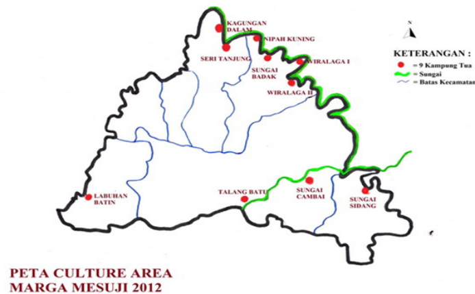
Figure 1. Cultural Area of Mesuji