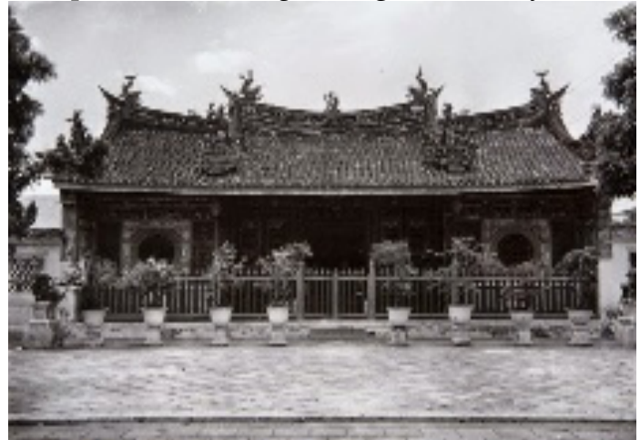
Figure 2. A photo of Klenteng Talang in the Early 20th Century<sup>1</sup>