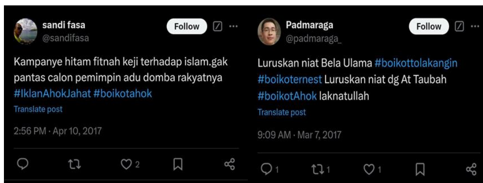
Figure 1. Screenshot of Social Media X 2

The hashtag and Trending Topic #BoycottAhok on platform X had its zenith amid the incident. Certain users linked the hashtag to critiques of Ahok's candidacy. For instance, the account @sandifasa stated: "Black campaign vile slander against Islam. It's not appropriate for prospective leaders to divide their people #IklanAhokJahat #boikotahok" (see, Figure 1 below).