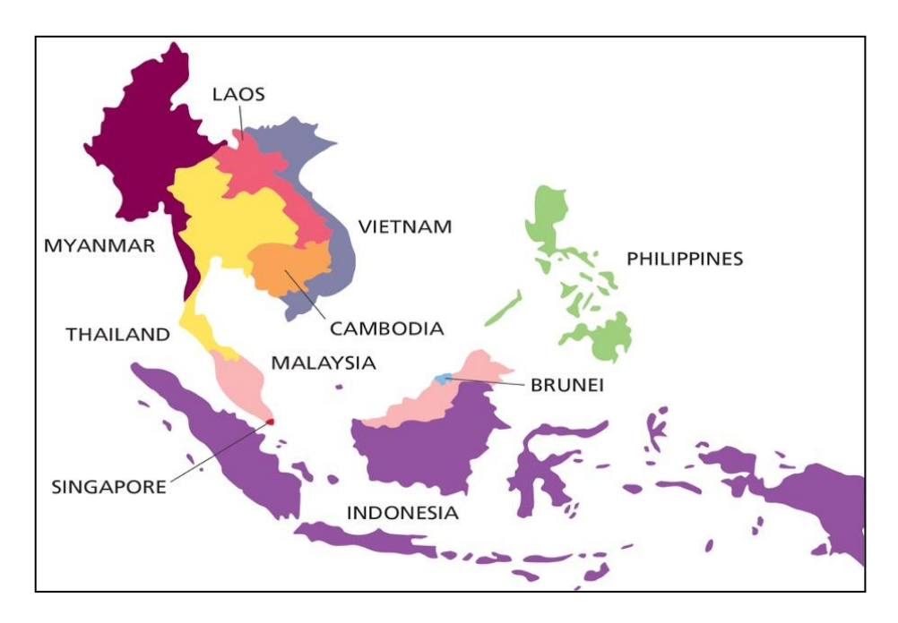
Figure 2: Map of Southeast Asia as significant carbon sinks - offers huge potential to benefit from REDD+ by facilitating 40% of the scheme's ability to reduce carbon dioxide emissions by 2050 (ADB, 2010).

for 65.5% of its total emissions as at 2013 (USAID, 2017) - largely due to peatland degradation, deforestation and forest fires. The region's vast forest land cover – which serve