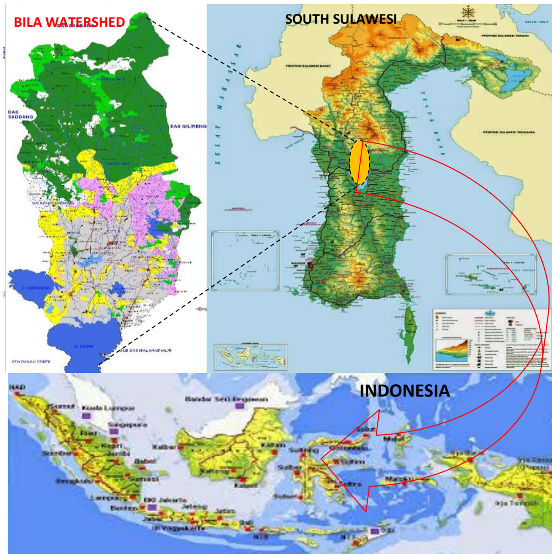
Figure 1. Watershed area as a research location

The research was done in the Bila Watershed in South Sulawesi, Indonesia (Figure 1). The watershed covers three jurisdictional districts, namely Enrekang, Sidenreng Rappang, and Wajo. The location of the research was conducted on dry lands marked as farming land. If it is generally a landscape with a critical gradient, it has an impact on the magnitude of the fluctuations in the river flow between two different seasons (rainy and dry seasons).