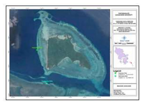
Figure 1. Map of research sites on Hoga and Kaledupa Islands, Wakatobi.

research station was carried out at two locations, namely Sampela station on Kaledupa Island and Pak Kasim station on Hoga Island.