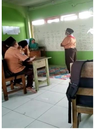
Figure 3. Parents motivate mentally retarded children in praying in front of teachers during PTM

Parents from a Javanese cultural background will give the spirit of teaching, not easily give up when doing various things, especially for their children in the hope that the child will progress in their development. The form of giving motivation from parents with Javanese background can be verbal and behavioral. Motivation in verbal form, for example, reminding mentally retarded children at all times so as not to neglect their duties and be disciplined in participating in learning. While motivation in the form of behavior is expressed by giving gifts to children if they have succeeded in doing their jobs well (Wahib, 2021). Below is a documentation of parents in motivating mentally retarded children when practicing movements and reading prayers in front of the teacher.