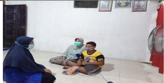
Figure 2. Interview with mentally retarded children and their parents

Based on study findings, it was concluded that the concern and participation of parents from Javanese cultural backgrounds in mentoring the learning of mentally retarded children during the Covid-19 pandemic had several roles, namely as motivators, educators, facilitators, directors, and supervisors. The following is the documentation when conducting interviews with research subjects.