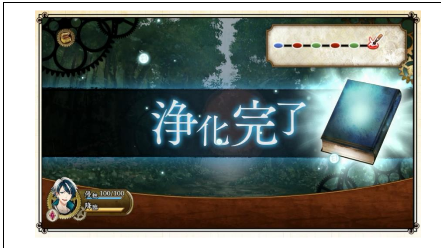
Figure 9. Hekigotou returned to yuugaisho after finishing his task (1)

Haiku 4 appears in the Bungou to Alchemist game when Kawahigashi Hekigotou's character finishes fighting the shinshokusha in a corroded book. Figure 4.1 shows the situation which Hekigotou successfully cleaned a book that was corroded due to a shinshokusha attack. Picture 4.2 shows Hekigotou's task of cleaning the corroded book has been completed.