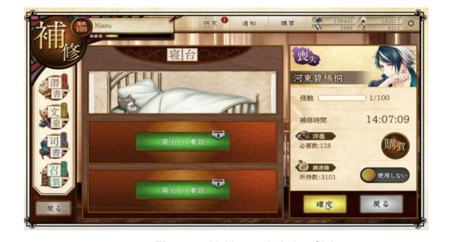
Figure 7. Hekigotou is Lying Sick

Haiku 3 is a haiku that appears in the Bungou to Alchemist game when Kawahigashi Hekigotou's character is treated in the infirmary in a weak state where the remaining health points (blood/life) are low. This situation is indicated by the number of (shinshoku), which is a term for the blood of this game character, only 1 in 100 and also the word (soushitsu) above Kawahigashi Hekigotou's name as shown in Figure 6. In Bungou to Alchemist, Soushitsu is a term used to describe a situation where the character's blood is only a little left, making the character weakened and potentially failing to fight the enemy or unable to fight anymore. Not only that, characters who are in a soushitsu state are also at risk of "death" if they are forced to continue fighting.