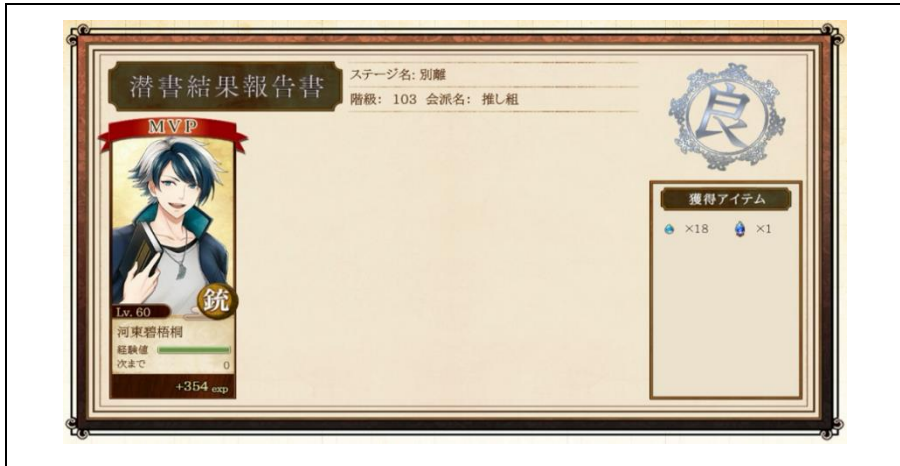
Figure 10. Hekigotou returned to yuugaisho after completing his task (2)

After the task of cleaning the corroded books was complete, Hekigotou returned to (yuugaisho), which is a place in the library containing books that were corroded due to shinshokusha attacks, after he finished his task, he returned to his yuugaisho, so the players will hear Hekigotou chant haiku 4. Figure 10 shows Hekigotou who has returned to yuugaisho after completing his task.