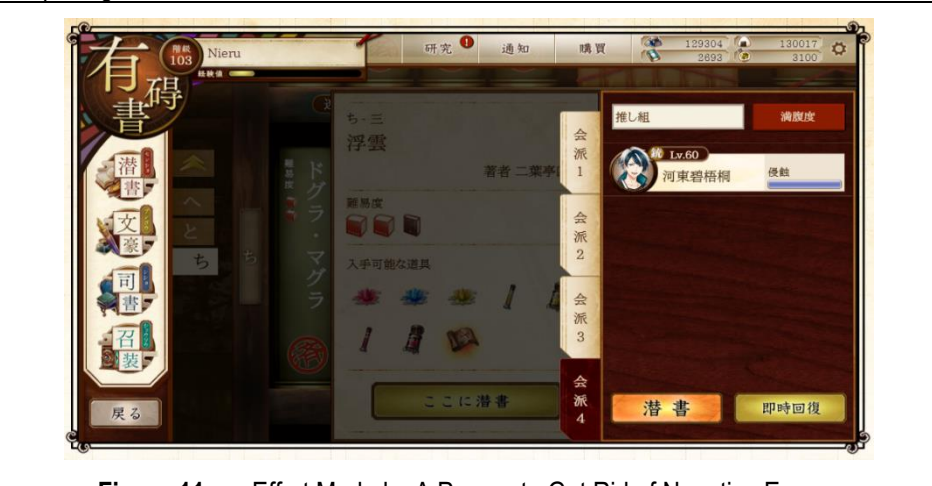
Figure 11. an Effort Made by A Person to Get Rid of Negative Energy

After the task of cleaning the corroded books was complete, Hekigotou returned to (yuugaisho), which is a place in the library containing books that were corroded due to shinshokusha attacks, after he finished his task, he returned to his yuugaisho, so the players will hear Hekigotou chant haiku 4. Figure 10 shows Hekigotou who has returned to yuugaisho after completing his task.