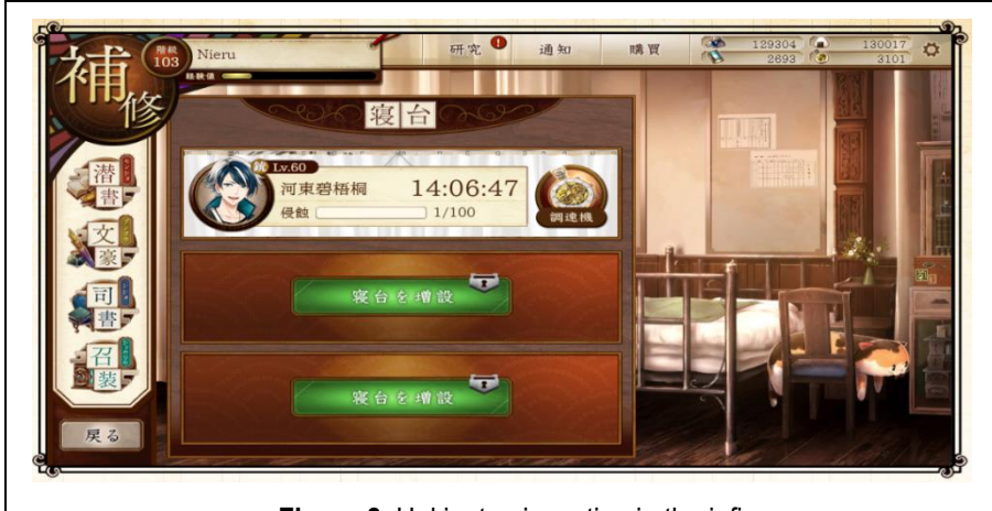
Figure 8. Hekigotou is resting in the infirmary

The connotation of haiku 3 means someone who is lying sick and trying to get well. After that, he rest his mind from these musings and start taking action to recover by taking medicine and getting enough sleep, and next, he recovers and starts his usual activities. The white bed which is usually used in hospitals represents a healthy return after resting. It is related to the place where this haiku appears in the Bungou to Alchemist game, it can be concluded that this haiku is used to represent Hekigotou's character that is in a weak state after fighting and trying to recover by resting.