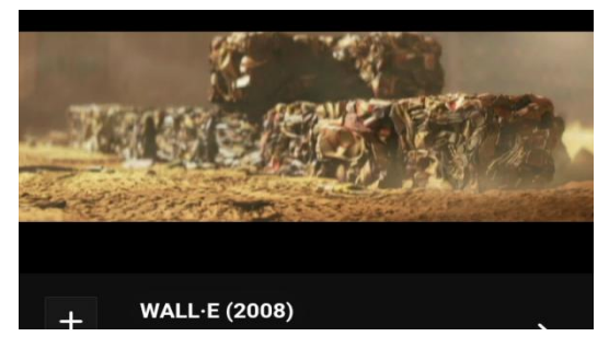
Figure 1. Hips of solid waste on the earth caused by thoughtless consumerism by earth inhabitants

Some films and documentaries exist whose themes are on waste management and the effect on biotic and abiotic creatures. Some of these films include Trashed, Wall-E (animation film), The Clean Bin Project, and A Plastic Ocean. The animated film, Wall-E, deals with the bad condition of the earth's environment. The central theme is the consequence of years of environmental degradation and thoughtless consumerism by the earth's inhabitants. It features a robotic animated character whose work is to clean the earth of garbage and waste. Because of bad waste management, the earth is no longer inhabitable. Humans then abandoned the earth for hundreds of years because the Earth is overrun with garbage and devoid of plant and animal life. Humans then relocated to space for several hundreds of years while Wall-e works tirelessly to clean up the earth for it to be inhabited again.