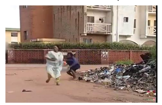
Figure 7. A scene from a Nollywood film, Christ in Me. The film shows a site of a hip of refuse dump located near a residential area in an urban city in Nigeria

Reflecting the themes of the films Wall-E, A Plastic Ocean, The Clean Bin Project, and Trashed, is capable of influencing and shaping Nollywood filmmakers' opinions towards creating the severity of solid waste and the importance of proper management in Nollywood. There are several documentaries and news bulletins on Nigerian television stations on waste management and environmental degradation and the need for a clean environment. While these clips educate the television audience on proper waste management, little or no full-length feature film tackles the problem of municipals and its effect on the citizens. There are however hundreds of scenes in Nollywood films where hips of refuse are shown near residential areas without references to its effect on occupants of the earth