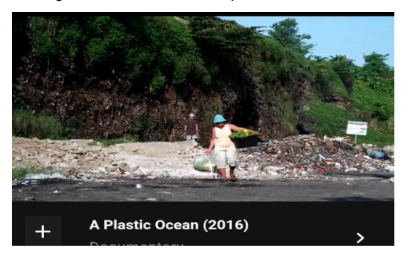
Figure 3. A clip from the film A Plastic Ocean. It shows refuse, especially plastics, thrown by the side of a river causing harm to sea creatures and humans

A Plastic Ocean is another documentary film that talks about the impact that plastic is having on our oceans and the marine animals that live there. Craig Leeson a journalist, Tanya Steeter, a diver, and a team of scientists investigate how human addiction to plastic is impacting the food chain and how that is affecting every one of us through new and developing human health problems. For four years, they explore the fragile state of our oceans, uncover alarming truths about plastic pollution, and reveal working solutions that can be put into immediate effect.