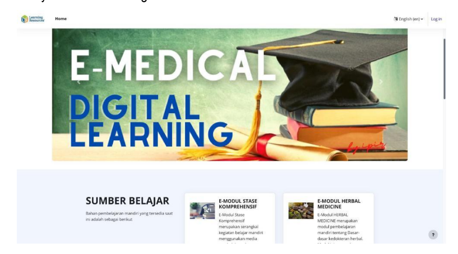
Figure 1. Learning Management System Developed on the Topic of Herbal Medicine

The satisfaction measurement instrument uses the End User Computing Satisfaction (EUCS) questionnaire developed by Doll & Torkzadeh in 1988. The EUCS questionnaire consists of aspects of content, accuracy, format, easy of use, and timeliness. In this study, the EUCS instrument has been valid and reliable. The measurement instrument for increasing knowledge uses two question packages consisting of pre-test and post-test. Pre-test and post-test questions are carried out construct validation by pharmacology experts, and continued content validation by medical education lecturers. Both question packs are valid and reliable. The qualitative satisfaction measurement instrument uses a semi-structured interview question list developed from the results of quantitative data analysis. The learning management system used in this study can be seen in Figure 1.