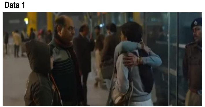
On duration 31:13, Delhi Airport - Departure Gate – Night.

a. Before Leaving (Farewells – family, relatives, friends)