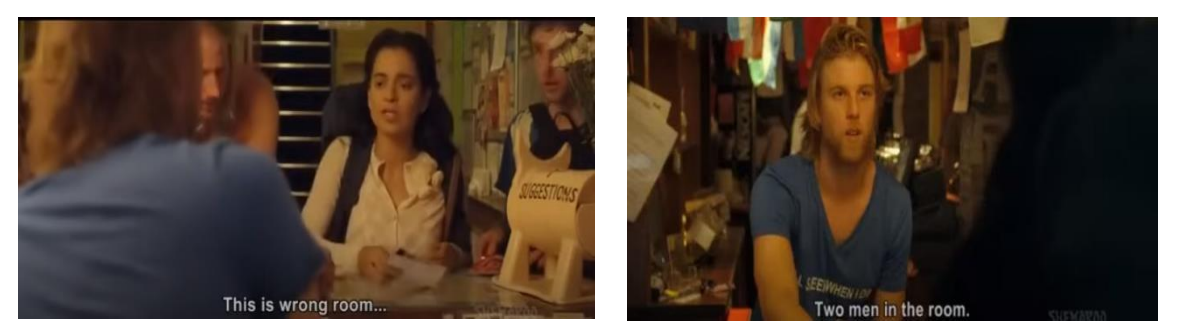
On duration 1:18:41 - 1:18:44, FLYING PIGS HOSTEL AMSTERDAM EVENING

Rani : "Kya??!! With 2 men? I want other room"