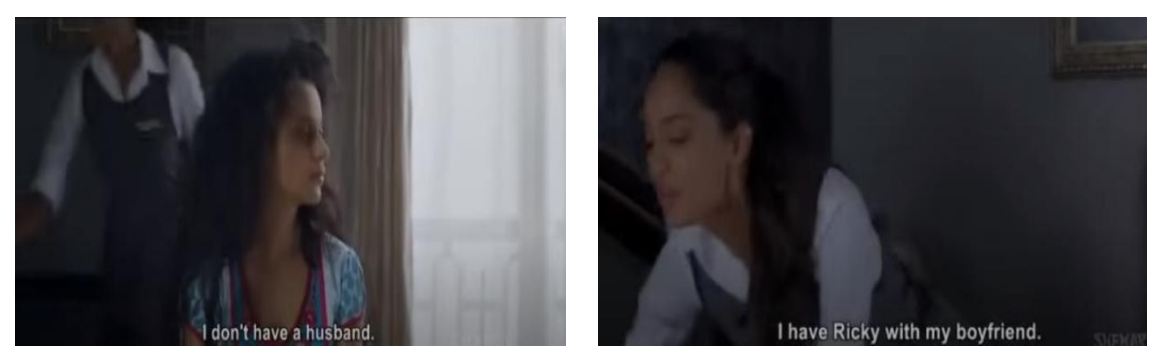
On duration 1:01:54 - 1:02:05, PARIS HOTEL ROOM – DAY

Vijaylaxmi : "Rani i make ricky with my boyfriend, i dont like marriage infact i dont even think about marriage"