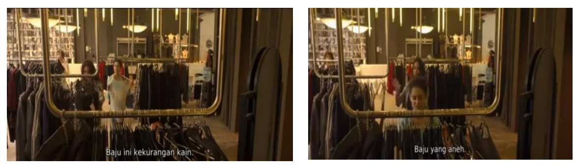
On duration 1:02:34 - 1:02:39, SUPERMARKET - DAY

Rani is picking up some really bad options while Vijaylaxmi is trying some really hot stuff.