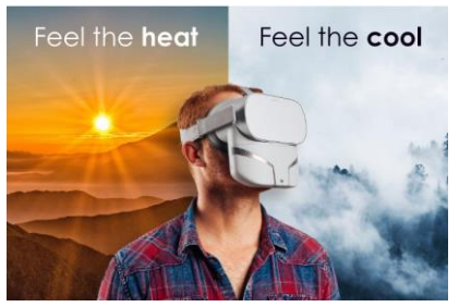
Fig. 4. FeelReal (1).

The FeelReal project (Figure 4) focuses on VR by creating helmets and masks that activate various senses. These gadgets include 3-D audio, high-resolution displays, micro-cooling, heating, adaptable vibrations, ultrasonic ionization for mist, seven scents, and a microphone, allowing the virtual experience to go beyond sight and sound (1).