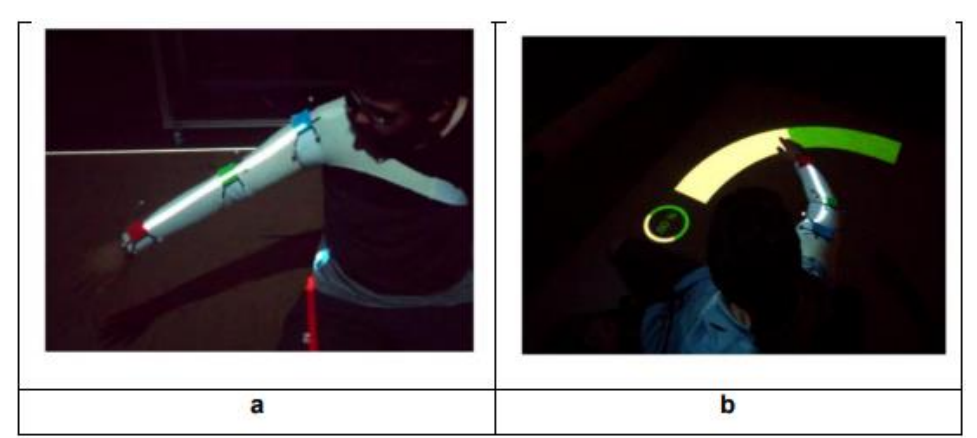
Fig. 6. (a) Sleeve is responsible for staying in the tracking equipment; (b) Real time visual feedback (22).