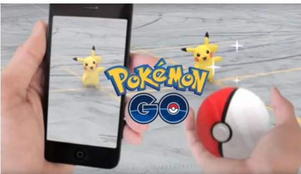
Fig. 3. Pokemon Go(21).

2.1.6. Virtual Reality: Extended Visual Security and Immersion