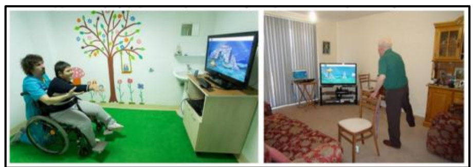
Fig. 2. Medical Interactive Assistance Recovery System consists of Kinect Motion Sensor and software for correcting exercises on games, A child (left) is practicing arm exercises and an elderly person (right) is practicing hip exercises

Certain activities of daily living (ADLs) need arm mobility. Every daily action requires a minimum amount of upper arm range of motion (ROM) to be completed (19). However, neurological conditions including multiple sclerosis, stroke, spinal cord injuries, nerve damage, etc., can restrict a person's range of motion, which further impairs their quality of life by preventing them from doing some everyday tasks. Identifying movement restrictions to aid in therapy planning and monitoring recovery to adjust treatment depending on patient progress are two steps in the process of regaining lost motor abilities. A motion capture device is necessary to quantify the intricate motions of the wrist, elbow, and shoulder in the seven-degree human upper extremity (20).