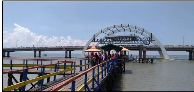
Fig. 4. Photos of Kenjeran tourism