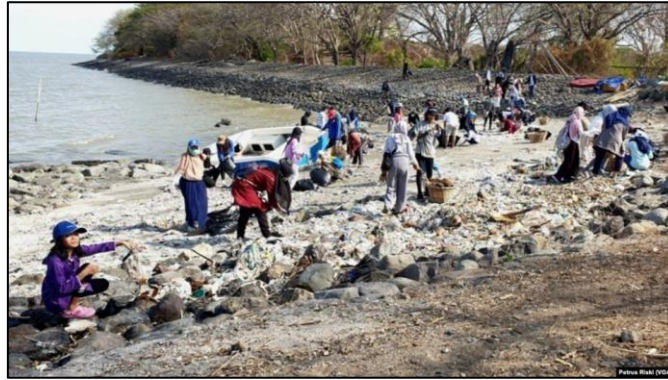
Fig. 3. Activities of tourists in the Kenjeran area