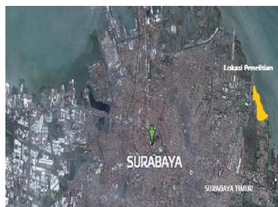
Fig. 2. Research Location in Surabaya [3]