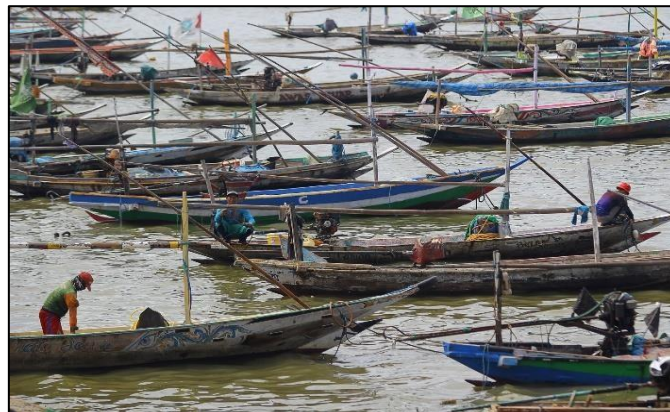
Fig. 5. Activities of Kenjeran coastal communities