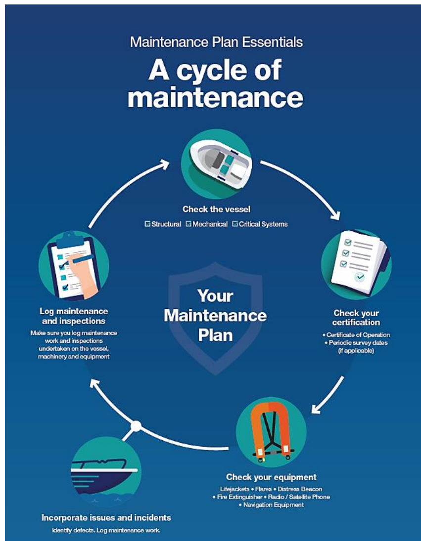
Figure 3. Maintenance Procedures

2. Key Benefits: Regular inspection and maintenance prevent sudden breakdowns and technical failures that can cause accidents. By keeping ships in optimal condition, the risk of