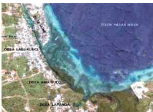
Figure 1. Location map of research Procedures

Figure 1 below shows the location of sampling, in Pasarwajo waters.