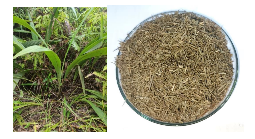
Figure 1. Source of C. latifolia leaf fiber

The holocellulose content of C. latifolia leaf fiber is 60.47%. The holocellulose content of C. latifolia leaf fiber is lower compared to other lignocellulosic materials (Table 1). However, the percentage of a-cellulose content is high compared to balsa, kapok fruit fibers (Purnawati et al., 2018), and bamboo (Maulana et al., 2018).