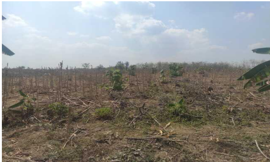
Figure 2. Pesanggem land cannot be planted due to long dry season

This forces Pesanggem to make ecological adaptations to the managed forest in order to continue to meet life's needs. The detailed ecological adaptations are presented below.