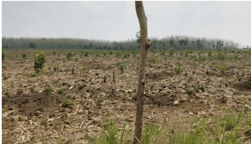
Figure 4. Pesanggem land planted with teak and eucalyptus trees

The plants used are also more diverse, namely a combination of forestry plants in the form of teak and eucalyptus trees, as well as corn and secondary crops. This varied type of plant with a rotational planting pattern (crop rotation) is managed by Pesanggem to adapt to the seasons (rainy and dry), and is able to maintain and maintain soil fertility and can even minimize forest erosion (Estiyantara, 2022) (Fig. 4).