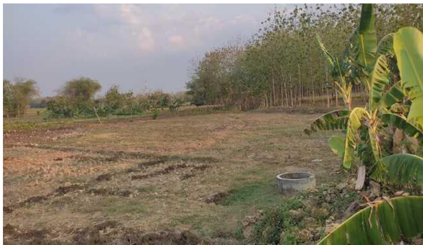
Figure 3. Availability of water from wells

The presence of PHBM directly reconstructs the community's relationship with forest areas, so that the community has access to involvement in utilization, management, conservation, and even forest guarding. So, this PHBM is able to provide ecological benefits for community adjustment to the forest. This can be seen from the availability of water, which previously still relied on rain. With this program, Pesanggem can irrigate its land with water sources from wells (Fig. 3).