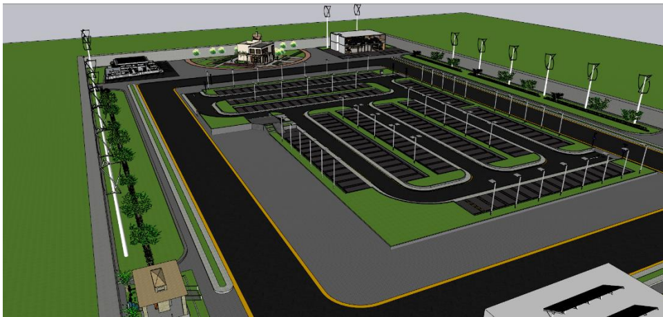
Fig.3 Detailed Overview Of Wind Turbine Placement