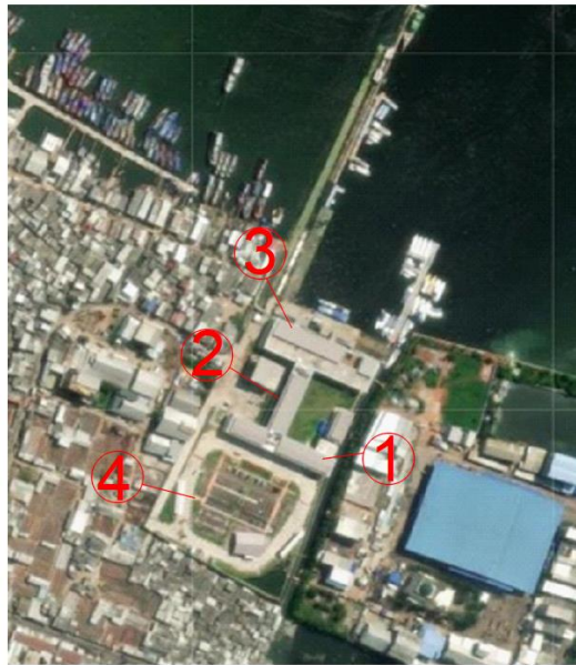
Fig.1 Top View of Port Plan